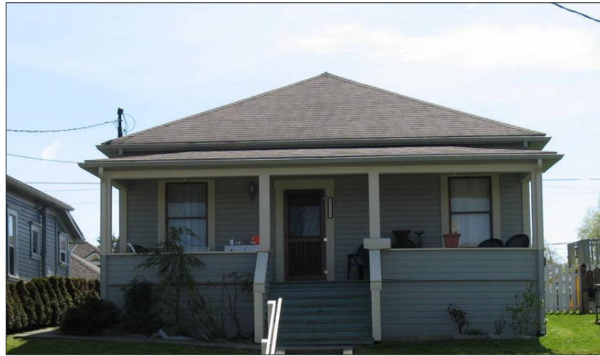
Figure 3 1313 6th Street